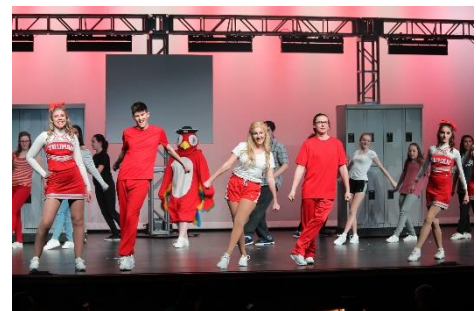
Bring It On, Spring Musical