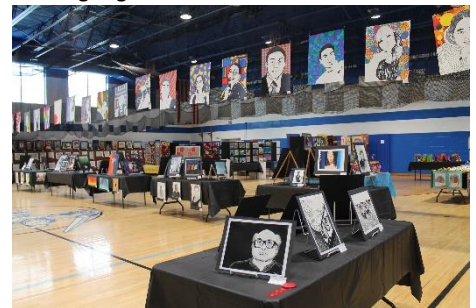
2018 Inter district Art Show