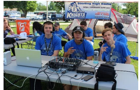
Sterling High School Radio